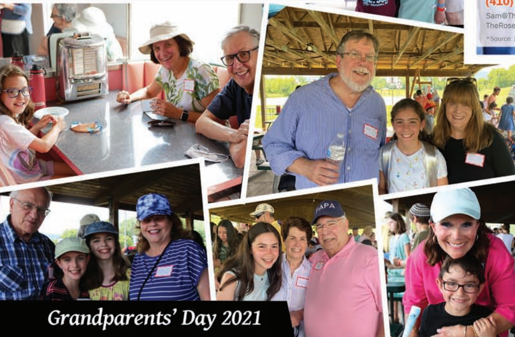
Grandparents' Day 2021