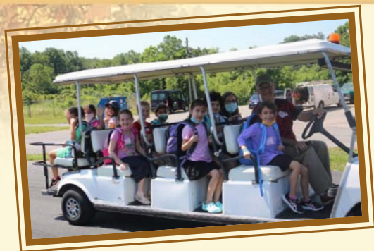
8 seat golf cart