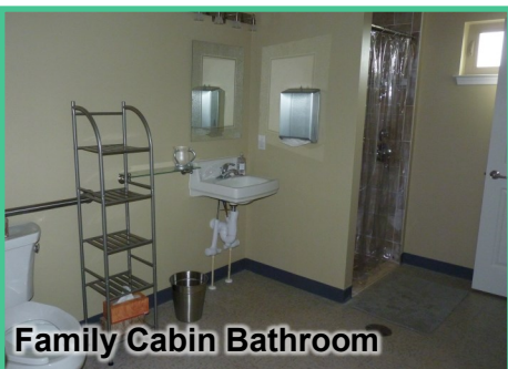
Family Cabin Bathroom