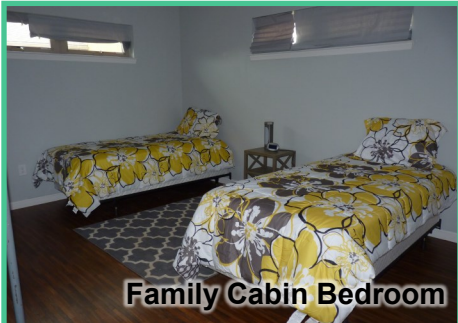
Family Cabin Bedroom