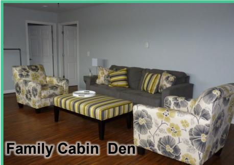
Family Cabin Den

Cancellations less than 15 days before the event will require full payment to Shoresh.